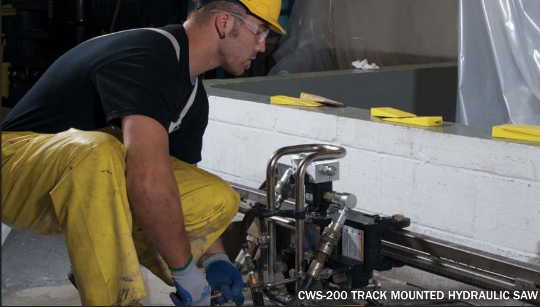
CWS-200 TRACK MOUNTED HYDRAULIC SAW