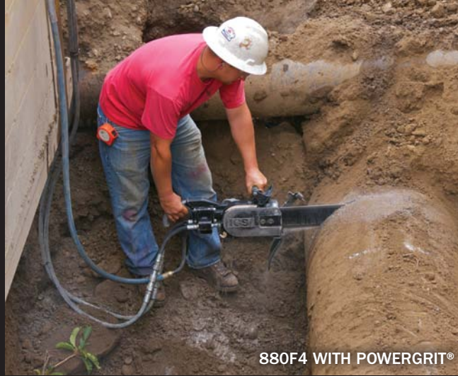
880F4 WITH POWERGRIT®