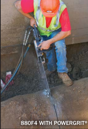
880F4 WITH POWERGRIT®